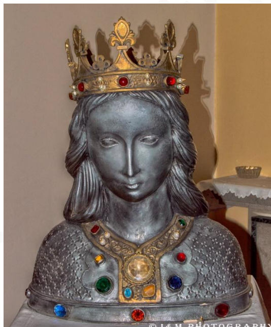
A replica of the missing presumed destroyed head reliquary of St Margaret of Scotland