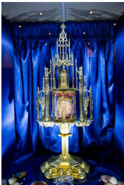
The reliquary containing the scapula of St Margaret of Scotland