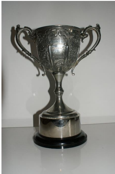
The Michael Canon Downey Memorial Golf Tournament Trophy